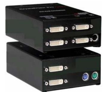
CrystalView DVI Fiber (Dual video model)