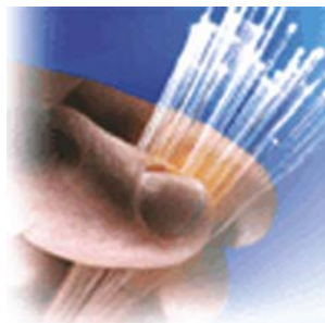
Fiber makes extended distances easy to reach

All models are available with both transmitter and receiver KVM access. The transmitter's KVM access allows an additional KVM station to be connected to the transmitter unit. If your system requires dual video, the CrystalView DVI Fiber dual video model can fully support it.