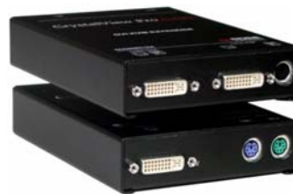
CrystalView DVI Fiber (Single video model)