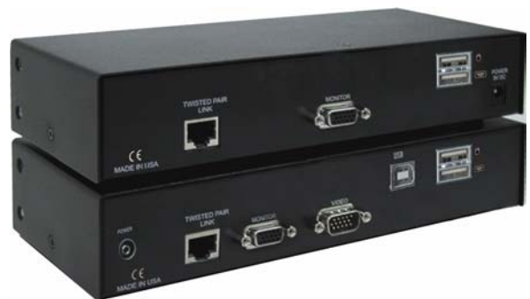
Rearview - CrystalView CAT5 USB KVM extender Remote (top) / Local (bottom)