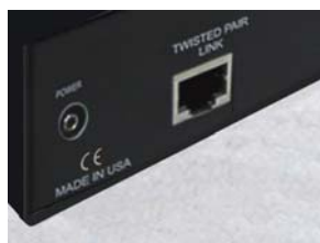
The link uses Standard CAT5 cable

Access to your computers is made convenient in a variety of situations. You can locate users away from hazardous industrial environments; locate CPUs away from areas vulnerable to theft of hardware and data; reduce noise and heat; increase desk and floor space. The dual access versions provide for a second KVM station at the local unit giving access to the CPU from either the local or remote unit.