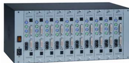
10 UNIT RACK