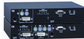
DUAL PC MODEL WITH AUDIO / SERIAL