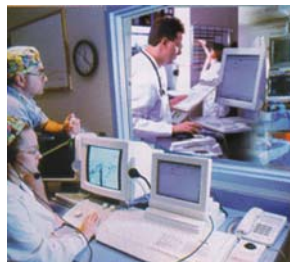
Medical or dental personnel access a computer from multiple locations

The MultiStation has a variety of other features to fine-tune your application. Call us to find out how the MultiStation can simplify your computer access.