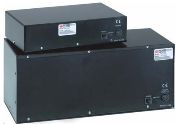
Rear view of MultiStation models ML-2U and ML-4U