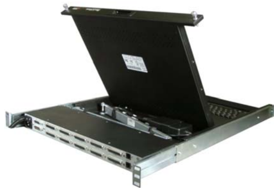
RackView with optional KVM switch

Environmental 32°F - 122°F (0° - 50° C), 20%-80% non-condensing RH