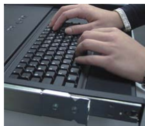
Easy access right at the rack

PC's, UNIX, Sun, and Apple computers can easily be accessed, monitored, and controlled locally using RackView.