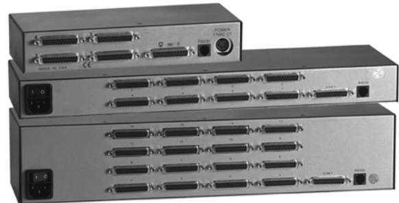
Rear view models : SPM-4UB / SPB-8UB / SPC-16UB

Rose Electronics 10707 Stancliff Road, Houston, Texas 77099 USA 281-933-7673 800-333-9343 (USA) +44 (0) 1264 850574 (Europe) +65 6324 2322 (Asia Pacific)