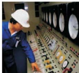
Connect up to 9 peripherals

The units can be daisy-chained for expansion. The versatility of the SuperSwitch makes it a practical investment for the budget-conscious.