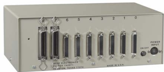
Rearview – model SS-9