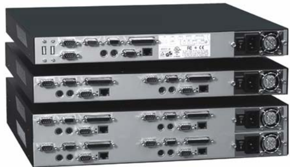
Rear view - UL-V3 / UL-DV3 / UL-QV3

Rose Electronics 10707 Stancliff Road, Houston, Texas 77099 USA 281-933-7673 800-333-9343 (USA) +44 (0) 1264 850574 (Europe) +65 6324 2322 (Asia Pacific)