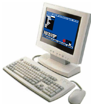
UltraMatrix on-screen menu

The UltraMatrix provides serial support to access computers, routers, Ethernet hubs, UNIX devices and more. It can perform as a "VT220" color terminal emulator with an eight-page scroll buffer. Local monitor connection, security, flash memory, system status, and a long list of other features ensure the UltraMatrix will streamline your data center or server room. Call us for more information on this and other excellent Rose products,