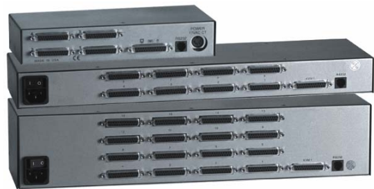
Rear view of UltraView Pro, 1x4 top, 1x8 middle, 1x16 bottom

Rose Electronics 10707 Stancliff Road, Houston, Texas 77099 USA 281-933-7673 800-333-9343 (USA) +44 (0) 1264 850574 (Europe) +65 6324 2322(Asia Pacific)