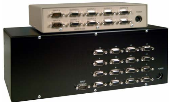
VSP-2X8VB model (top) / VSP-1X16VB model (bottom)