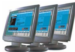
Drive multiple monitors From 1 or 2 computers

The VideoSplitter is rack mountable with optional 19", 23", and 24" rack mount kits.