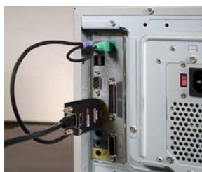
Direct connect CAT5 Transmitter streamlines your installation

As the inventors of the KVM switch, Rose continues to provide leading solutions for your server management needs. With headquarters in the US and offices in Europe and Asia, Rose provides a full range of capabilities and support. Call us today for more information about this and other Rose products.